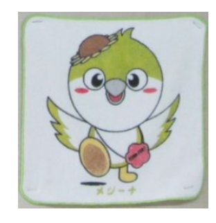
Towel handkerchiefs with printed Kumatori Town's mascot, "Mejina-chan"

<*1> The yarn used in towel production is first starched or waxed so as to make it strong and slippery for smoother weaving. Thus, the towel just woven is water repellent. However, going through the blanching process after having been woven, the later blanching method towel is rendered free of starch or wax, and becomes water absorbent.