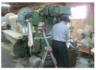
Setting/Maintaining Weaving Machines